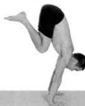
Nose Aṣṭāvkrāsana B