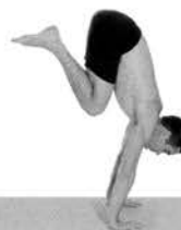
Nose Aṣṭāvkrāsana B