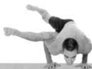
Nose Kouṇḍīnyāsana B