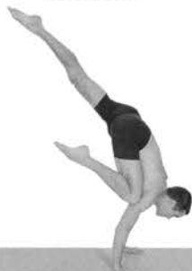
Nose Eka Pāda Bakāsana A