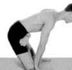
Nose Ūrdhva Kukkuṭāsana C